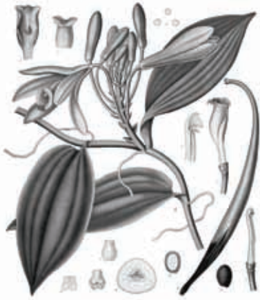
Vanilla planifolia Jacq.