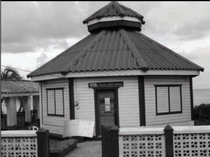
BTIA's distinguished octagonal Information Center on Front street in Punta Gorda. All you need to know about Toledo is inside

Great Value Advertizing in the Howler Promote your business in our classified section $25 for up to 21 words! Phone 722-2276