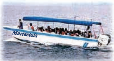
Charters to Fulfill Your Needs